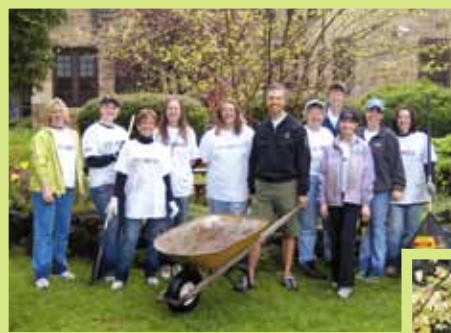
Day of Caring, 2009: Harter Secrest and Emory, LLP

Here is a quick look back over the past year! Please note, photos are not inclusive of all volunteers who contribute to our success, yet we are equally grateful for all of our volunteers!