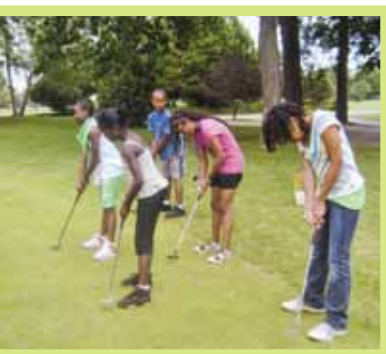
Genesee Valley golf lessons

Once again the Rochester community hand-delivered hope and cheer for the holidays! Thank you for helping to bring joy to our families.