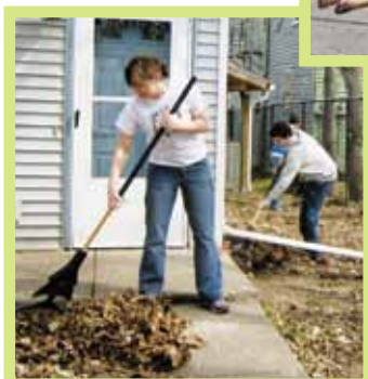
University of Rochester Women's Caucus Spring Sweep